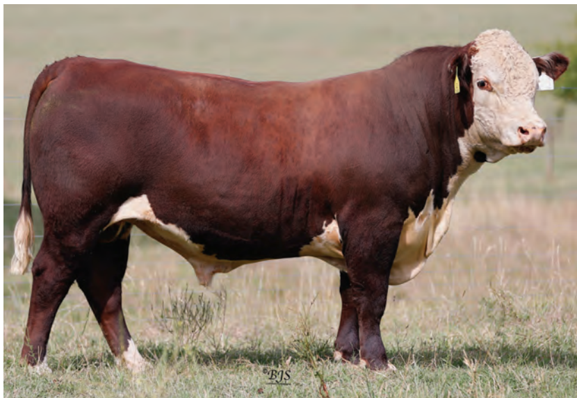
LOT 2 - NEWCOMEN UMBRELLA (HPR) (P)