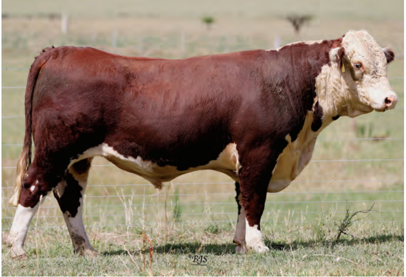
LOT 10 - NEWCOMEN ULTERIOR (HPR) (P)