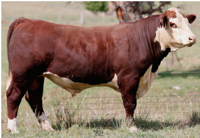
LOT 13 - NEWCOMEN ULONG (PP)