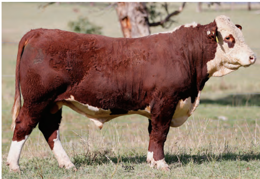
LOT 20 - NEWCOMEN UNARMED (HPR) (H#)