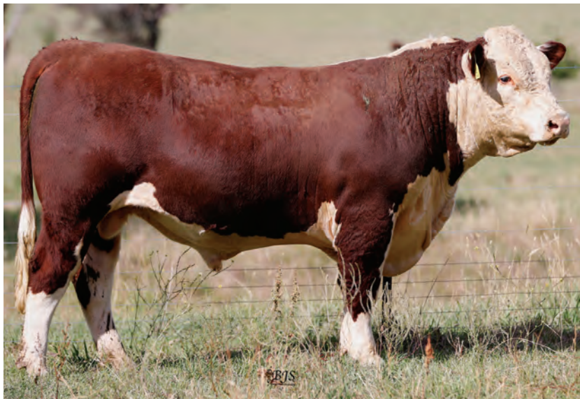
LOT 18 - NEWCOMEN ULURU (H)