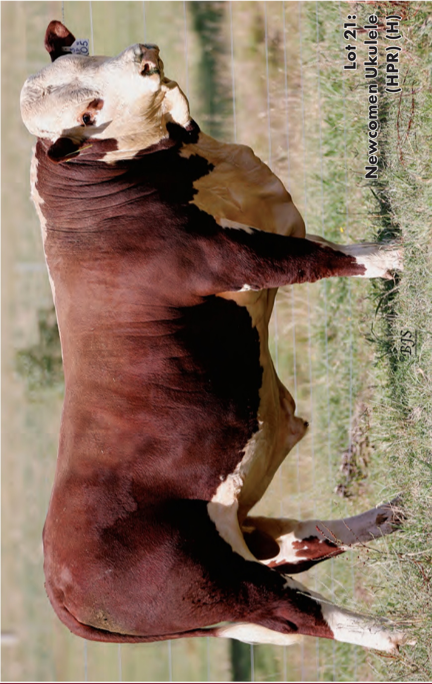
Lot 21: Newcomen Ukulele (HPR) (H)