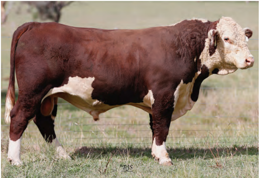
LOT 5 - NEWCOMEN UBOAT (HPR) (PP)