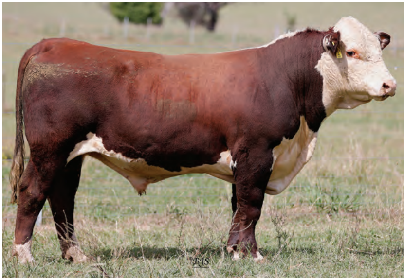
LOT 6 - NEWCOMEN ULTIMO U108 (HPR) (P)