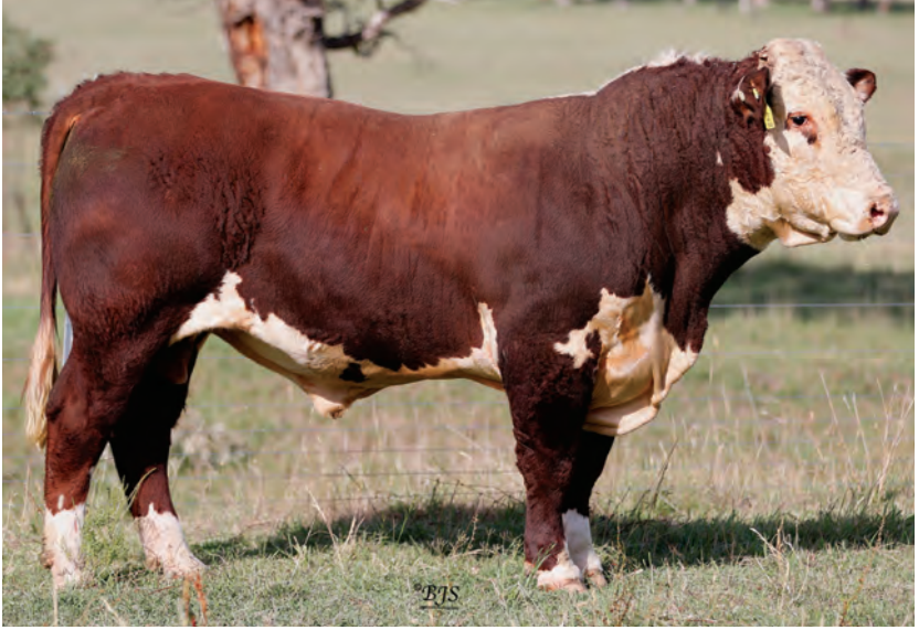
LOT 16 - NEWCOMEN ULVERSTONE (H)