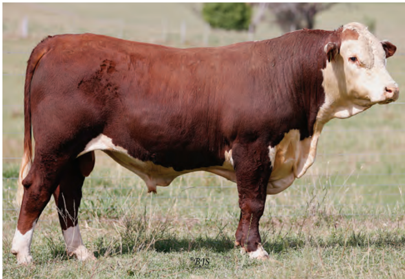
LOT 1 - NEWCOMEN UMBILICAL (HPR) (PP)