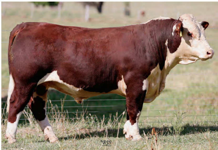
LOT 15 - NEWCOMEN UGBOOT (HPR) (H)