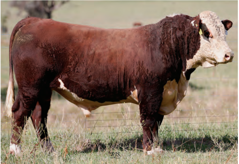
LOT 17 - NEWCOMEN UPBEAT (HPR) (H)