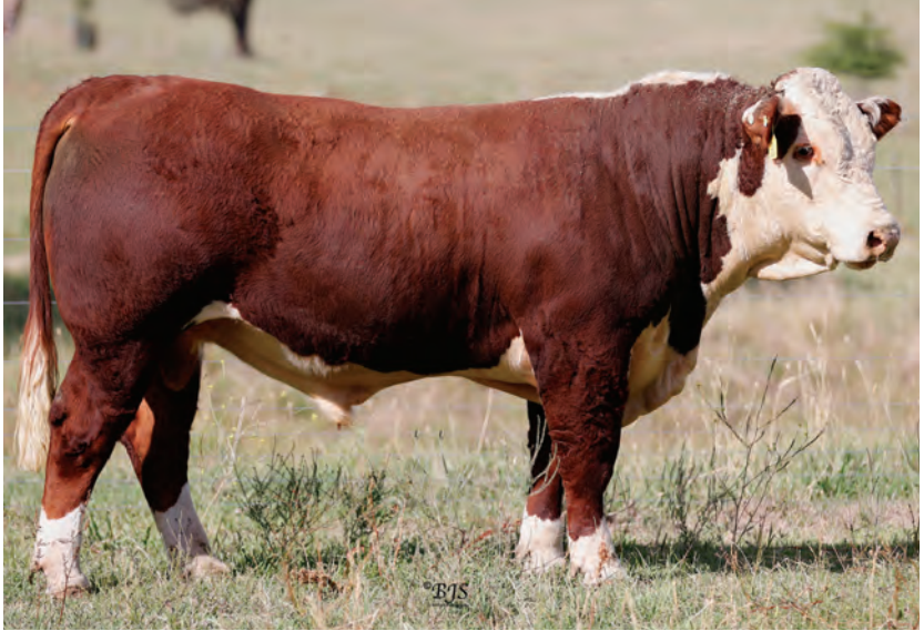
LOT 22 - NEWCOMEN UNAWARE (HPR) (H#)