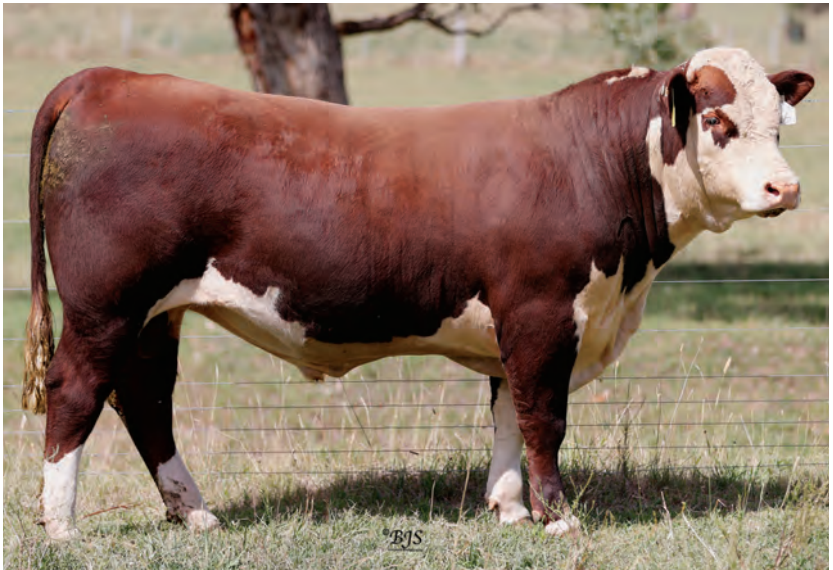
LOT 11 - NEWCOMEN UNAFFECTED (HPR) (P)