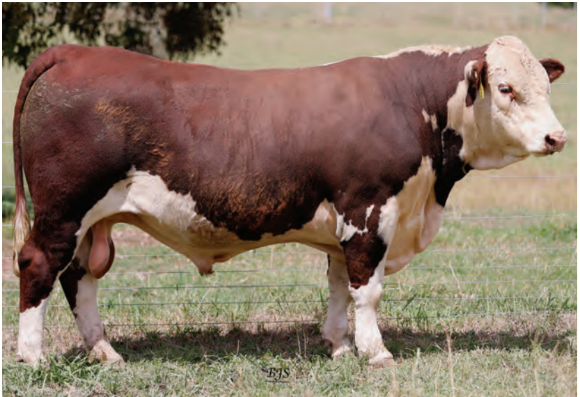
LOT 23 - NEWCOMEN URANGA (P)