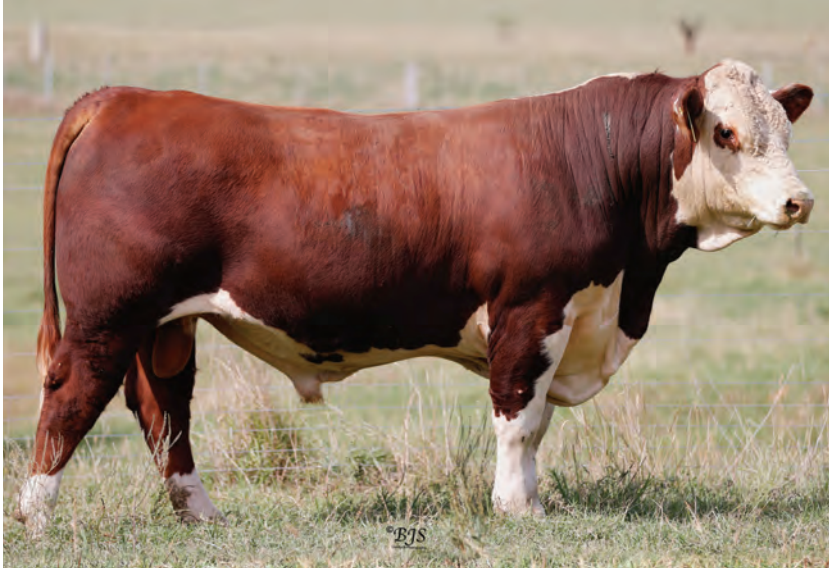
LOT 4 - NEWCOMEN UTAH (P)