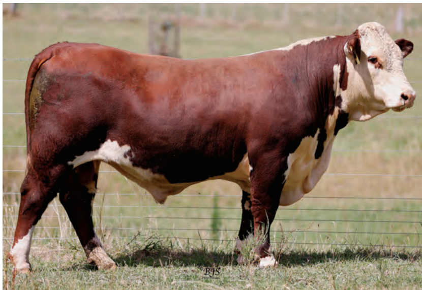
LOT 7 - NEWCOMEN ULNA U107 (HPR) (H#)